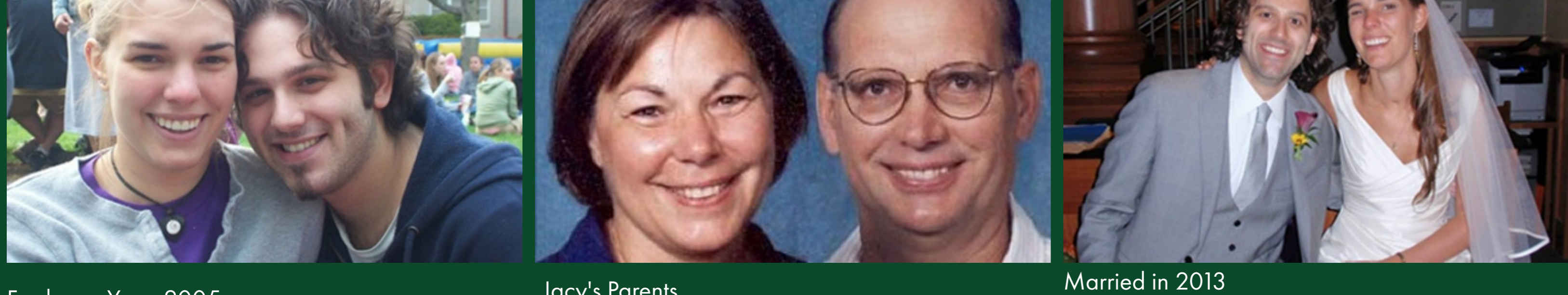
Freshman Year, 2005